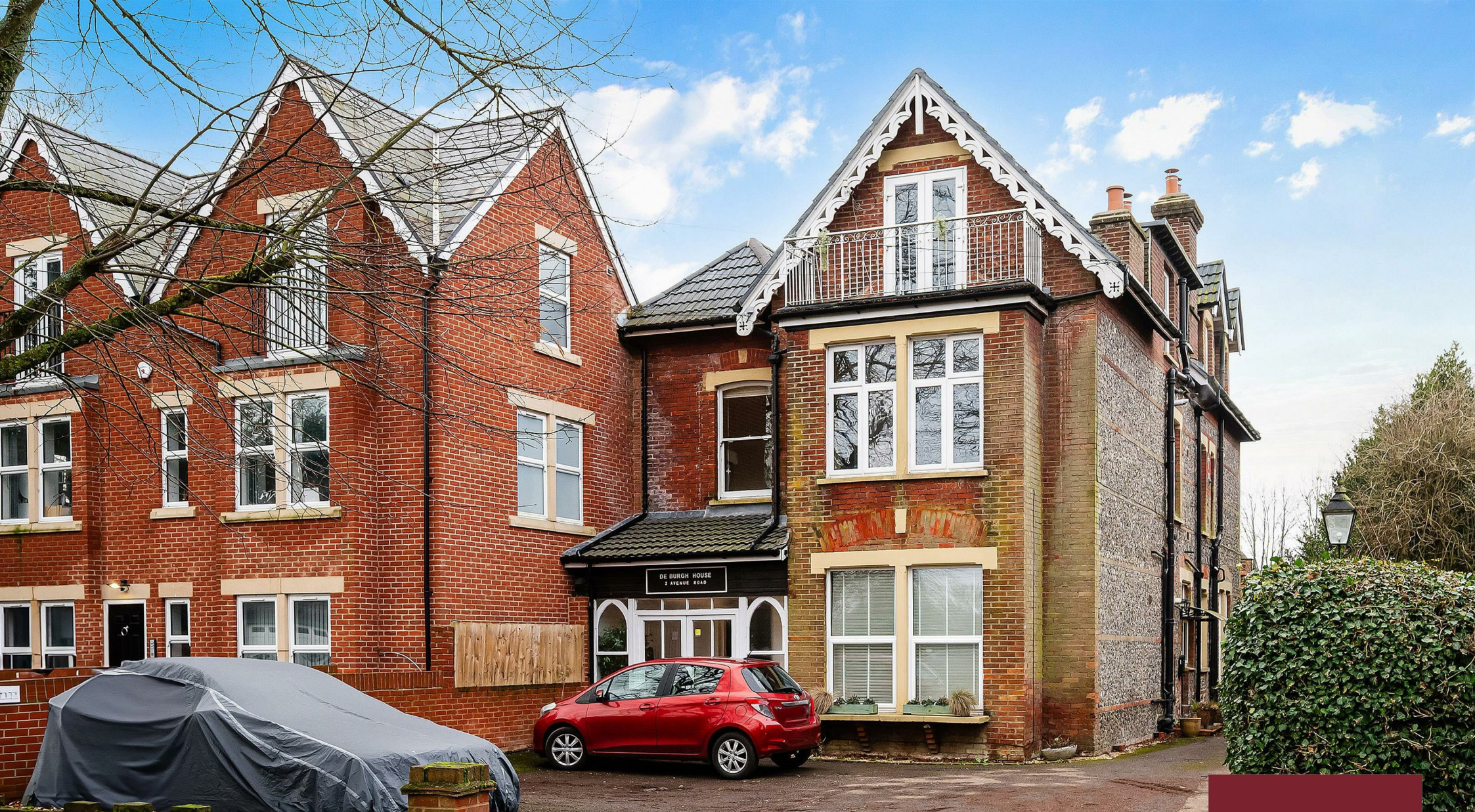
De Burgh House, Banstead, Surrey £650,000 - Leasehold - Share of Freehold